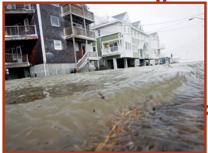
President Trump's August 2017 Executive Order revoked the Obama-era requirement that federally-funded infrastructure projects adhere to a Federal Flood Risk Management Standard that incorporates sea-level rise projections and other climate impacts.

dismantled climate change initiatives through elimination of climate research programs, disbanding of key advisory committees, censorship of climate change information, and the announcement of its intention to withdraw the United States from the Paris climate agreement. Even with the increasingly dire findings from the recent study completed by the Intergovernmental Panel on Climate Change and the National Climate Assessment, President Trump has adamantly refused to acknowledge the imminent threats of a warming planet. When asked about the federal government's National Climate Assessment report, which included the conclusion that climate change will result in a ten percent loss in Gross Domestic Product (GDP) by 2100 if no action is taken, President Trump simply responded, "I don't believe it."